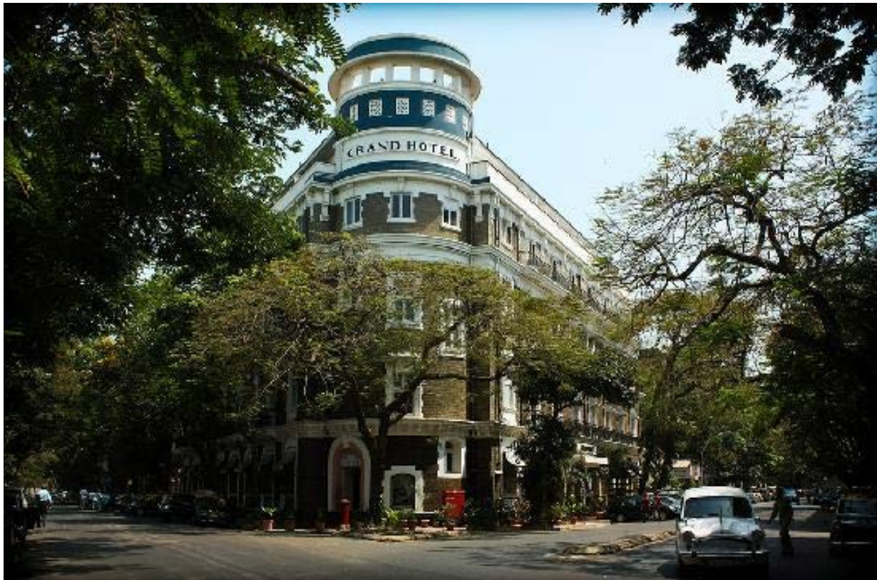
Figure 2: Exterior photo of hotel entrance